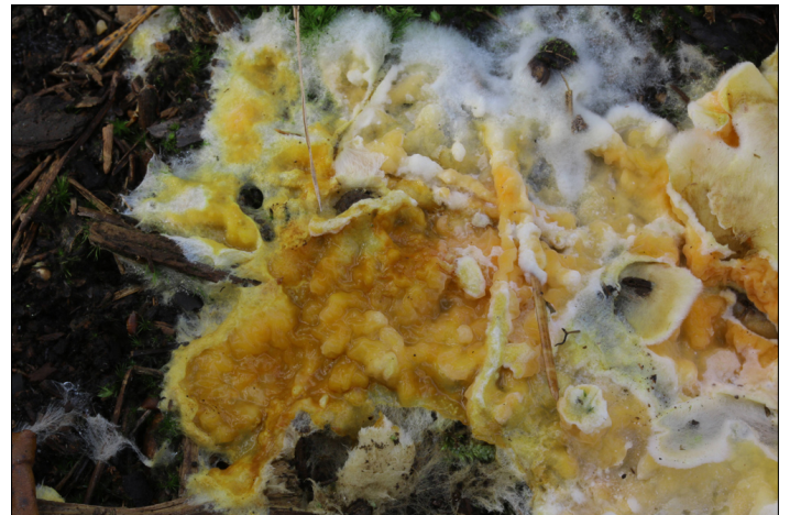
Above: two views of the unusual Leucogyrophana mollusca (no English name), also found here in 2022 (SJE & CVS)