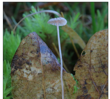
Right: Mycena smithiana