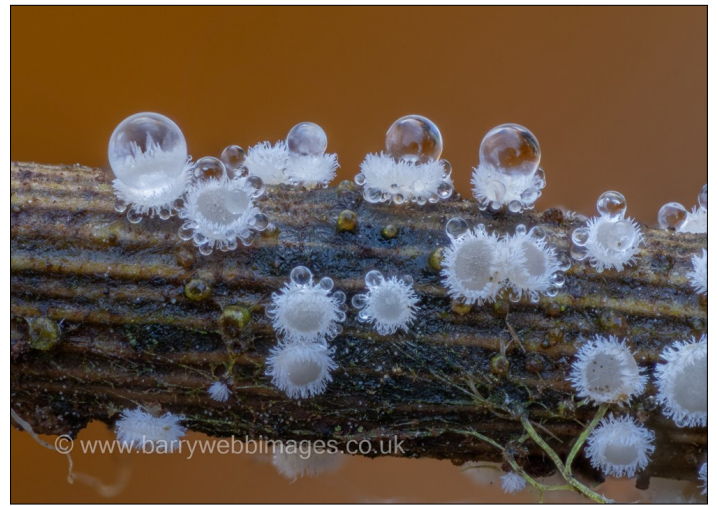
Above left: Cylindrium aeruginosum on an Oak leaf (SP), and right: Lachnum apalum on a Juncus stem (BW)