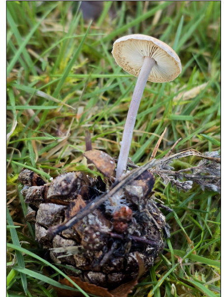
Right: Baeospora myosura (JL)

Moving now to some smaller species, many people showed me specimens of the LBJ Baeospora myosura (Conifer Conecap) - a common species under the Pines but confusing to identify when not obviously fruiting on a fallen cone as seen in this photo. Often the cone will have disintegrated thus the most obvious clue to its identity is missing, in which case the pale buff cap and stem together with very crowded gills should be sufficient. Beware, however, of another LBJ which grows on fallen cones! The genus Strobilurus (not seen today) also grows on cones – both Pine and Spruce according to species – but is much less common, has a more mycenoid appearance, a smoother darker cap and often a longer less stocky stem which discolours yellow towards the base. Microscopic features are also very different.