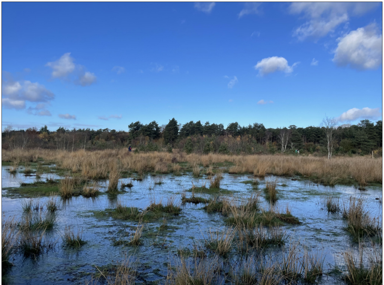
Below: a beautiful view of Stoke Common this morning (SJE)