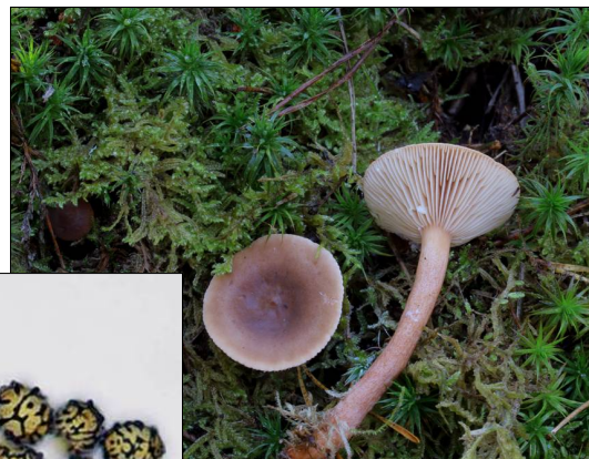
Right: Lactarius hepaticus with insert of the spores x 1000