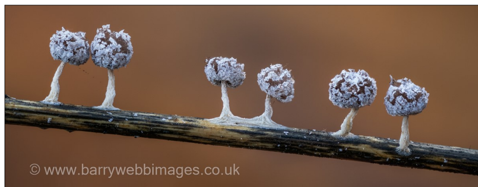
Left : Didymium squamulosum ( a slime mould) (BW)