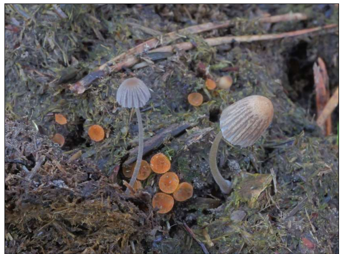
Right: Tulosesus pellucidus (MT)

Still on the dung theme, the tiny orange discs seen in Mario's Inkcap photo were the subject of much discussion, and careful examination with a handlens revealed a delicate circle of eyelash-like